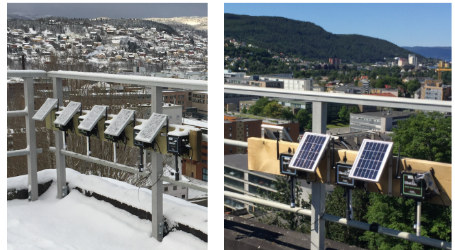
Figure 1. Sensor nodes used for testing in real weather conditions.